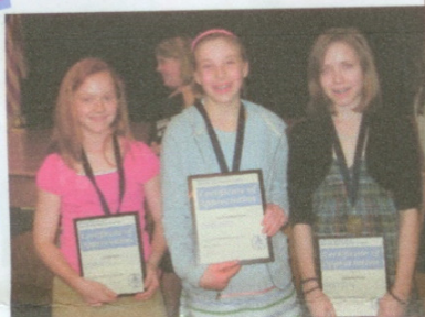
←↑THE WINNERS of GJOC's 2010 Oratorical Contest held at St. James School!