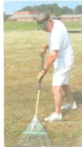
↔ HOT Clean-up, the day after!