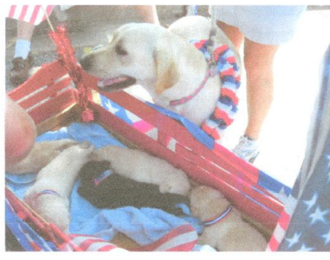
↓ Mama & Puppies!