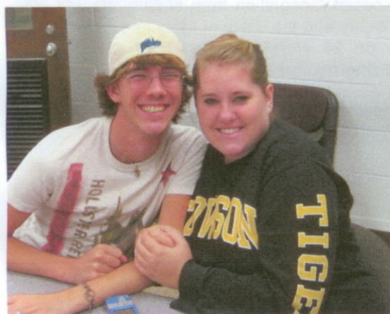
Pictured below: Members of the TU Optimist Club at their October 14 meeting.