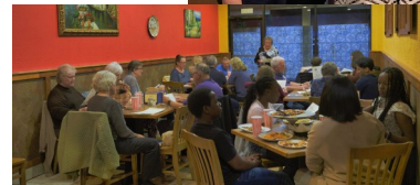
40th Anniversary Dinner